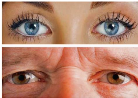
Figure 3: Photos of eyes displayed above the dispensers.

Speakers have mentioned this interesting article wrote by King et al. several times. They applied priming in infection control. Psychological priming is the process by which exposure to certain cues (e.g., words, smells, or images) alters behavior without the person being aware of the impact of the cue on their behavior. In that case, the cue was being watched, which more widely has been seen to encourage prosocial behaviors. During the intervention, photos of eyes were displayed above the dispenser, and it worked. In case of the male eyes hand hygiene compliance increased significantly, from 15% to 33%. These findings are especially important, because sticking a pair of eyes above the handrub dispenser is an extremely cost-effective way to improve hand hygiene compliance.