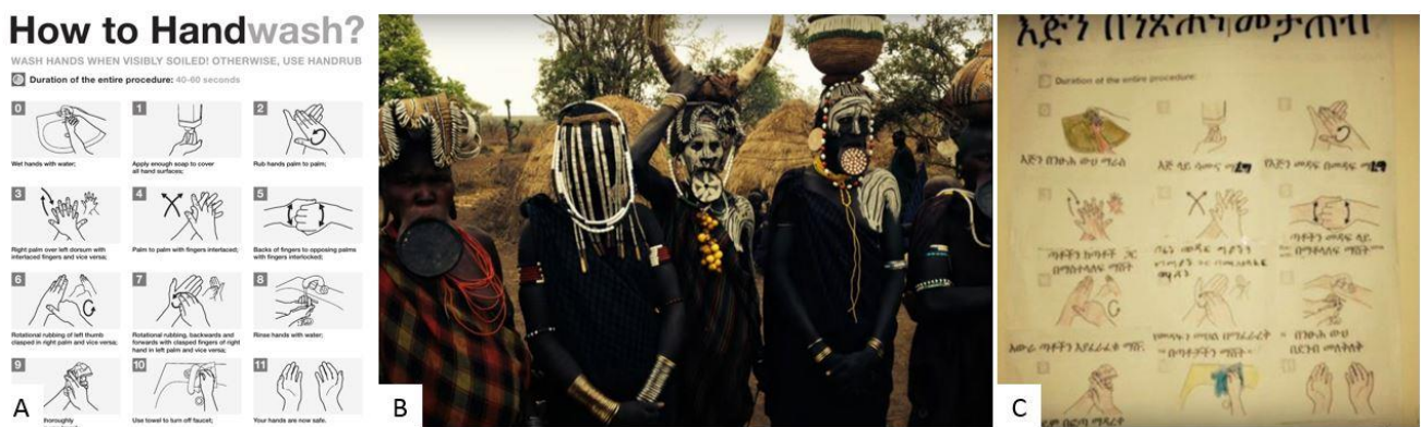
Figure 1: Adapt to adopt; A: WHO ‘How to handwash poster’, B: traditional costumes in Turmi, Ethiopia, C: Local adoption of the ‘How to handwash’ poster in Turmi.

“If you want people to adapt a new strategy, you need to let them adopt it. Adopt it to their resources, their beliefs, their culture.” For example the WHO ‘How to handwash’ poster now is widely adapted in various formats. Watch this video , where Didier Pittet talks more about the Adapt to Adopt conception.